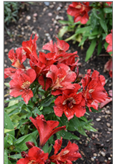
Colorita Kate Alstroemeria flowers