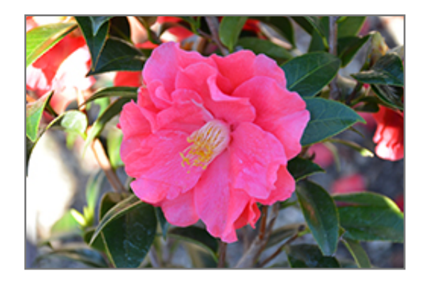
Coral Delight Camellia flowers