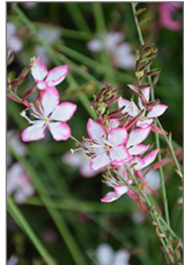
Rosy Jane Gaura flowers

This is a relatively low maintenance plant, and is best cleaned up in early spring before it resumes active growth for the season. It is a good choice for attracting butterflies to your yard, but is not particularly attractive to deer who tend to leave it alone in favor of tastier treats. It has no significant negative characteristics.