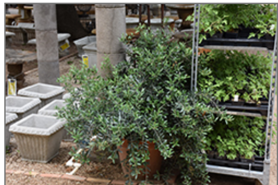
Little Ollie&reg Dwarf Olive