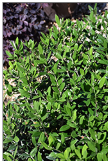
Little Ollie® Dwarf Olive foliage

* This is a 'special order' plant - contact store for details