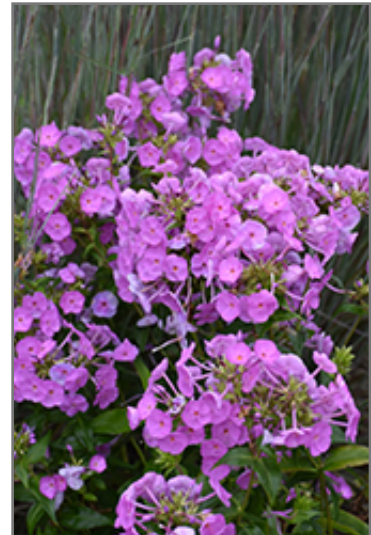
Fashionably Early Flamingo Garden Phlox flowers

Fashionably Early Flamingo Garden Phlox is a dense herbaceous perennial with an upright spreading habit of growth. Its medium texture blends into the garden, but can always be balanced by a couple of finer or coarser plants for an effective composition.