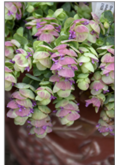
Kirigami Oregano flowers