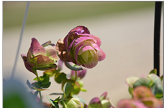
Kirigami Oregano flowers

Kirigami Oregano is an herbaceous perennial with an upright spreading habit of growth. Its relatively fine texture sets it apart from other garden plants with less refined foliage.