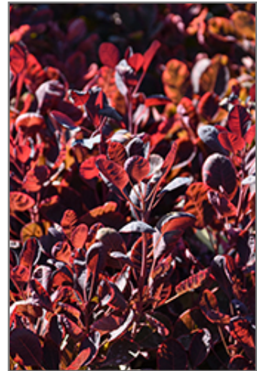
Velveteeny Purple Smokebush foliage

* This is a 'special order' plant - contact store for details