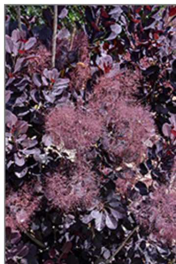
Velveteeny Purple Smokebush flowers

Velveteeny Purple Smokebush is recommended for the following landscape applications;