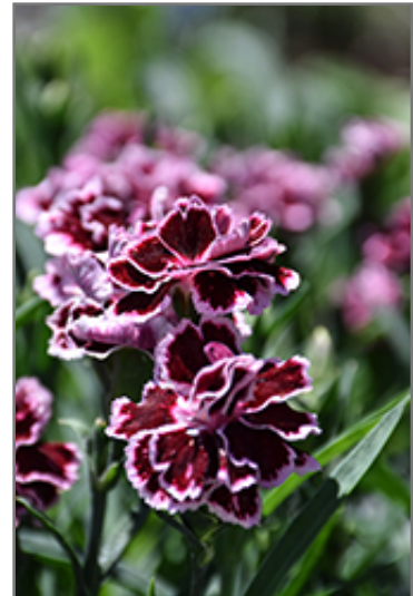
Odessa Pierrot Pinks flowers

This is a relatively low maintenance plant, and is best cleaned up in early spring before it resumes active growth for the season. It is a good choice for attracting bees and butterflies to your yard, but is not particularly attractive to deer who tend to leave it alone in favor of tastier treats. It has no significant negative characteristics.