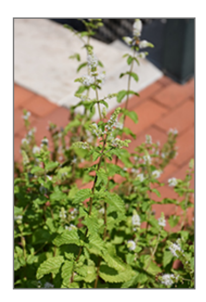
Cuban Mint flowers

This is an herbaceous perennial herb with an upright spreading habit of growth. Its medium texture blends into the garden, but can always be balanced by a couple of finer or coarser plants for an effective composition. This is a high maintenance plant that will require regular care and upkeep, and should be cut back in late fall in preparation for winter. It is a good choice for attracting bees and butterflies to your yard, but is not particularly attractive to deer who tend to leave it alone in favor of tastier treats. Gardeners should be aware of the following characteristic(s) that may warrant special consideration;