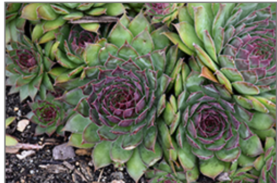
Black Hens And Chicks