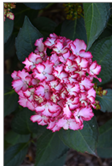
Seaside Serenade Fire Island Hydrangea flowers