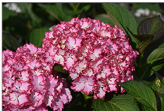
Seaside Serenade Fire Island Hydrangea flowers

Seaside Serenade Fire Island Hydrangea is a multi-stemmed deciduous shrub with a more or less rounded form. Its relatively coarse texture can be used to stand it apart from other landscape plants with finer foliage.