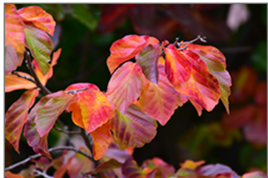
Persian Parrotia in fall