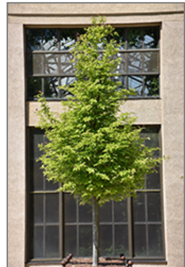
Persian Parrotia