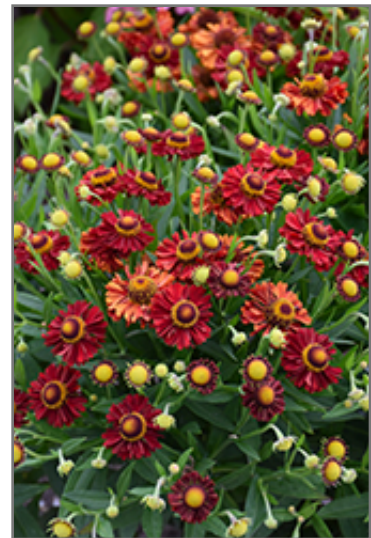
Mariachi Ranchera Sneezeweed flowers