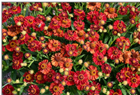
Mariachi Ranchera Sneezeweed flowers