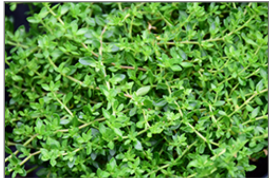
Rupturewort foliage

This is a relatively low maintenance plant, and may require the occasional pruning to look its best. Deer don't particularly care for this plant and will usually leave it alone in favor of tastier treats. It has no significant negative characteristics.