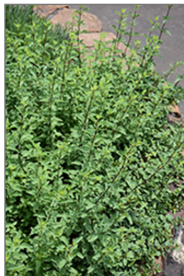
Hopley's Oregano