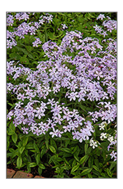
Woodland Phlox flowers