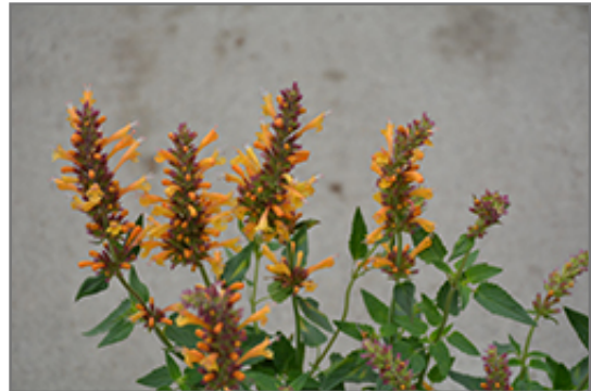
Kudos Gold Hyssop flowers