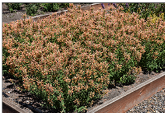
Kudos Gold Hyssop in bloom