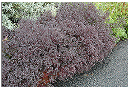
Bertram Anderson Stonecrop