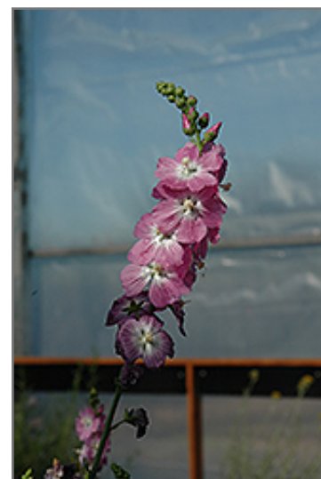
Stark's Hybrids Prairie Mallow flowers