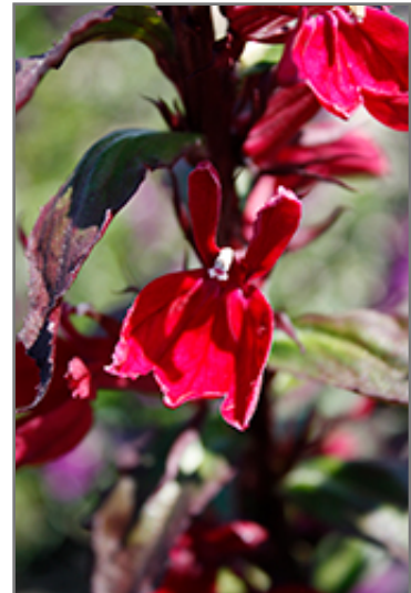
Starship Burgundy Lobelia flowers

Starship Burgundy Lobelia is recommended for the following landscape applications;