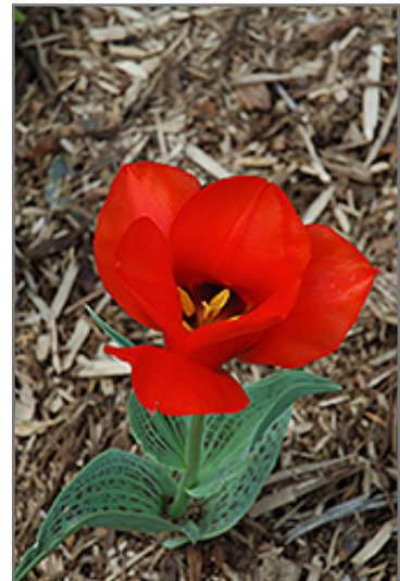
Casa Grande Tulip flowers