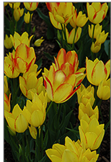
Georgette Tulip flowers