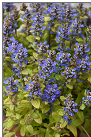
Feathered Friends Fancy Finch Bugleweed flowers

Feathered Friends Fancy Finch Bugleweed is a dense herbaceous evergreen perennial with a ground-hugging habit of growth. Its relatively fine texture sets it apart from other garden plants with less refined foliage.