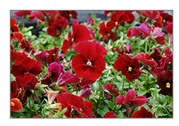
Penny Red Pansy flowers