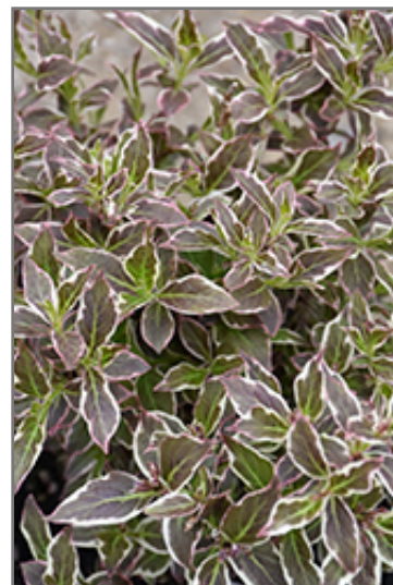
My Monet Purple Effect Weigela foliage