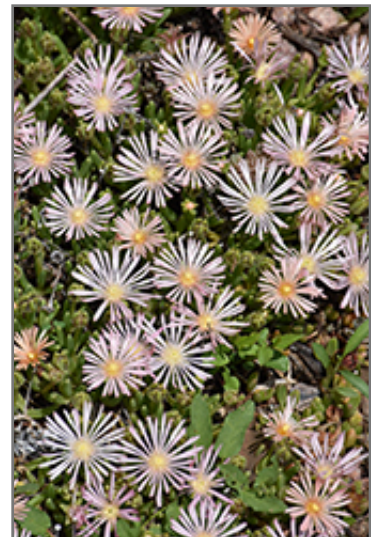
Alan's Apricot Ice Plant flowers

Alan's Apricot Ice Plant is recommended for the following landscape applications;