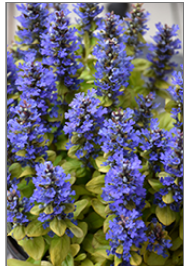
Feathered Friends Petite Parakeet Bugleweed flowers