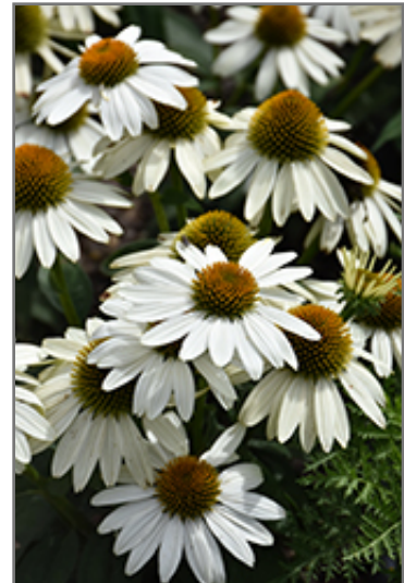
Sombrero Poco White Coneflower flowers

This is a relatively low maintenance plant, and is best cleaned up in early spring before it resumes active growth for the season. It is a good choice for attracting butterflies to your yard, but is not particularly attractive to deer who tend to leave it alone in favor of tastier treats. It has no significant negative characteristics.