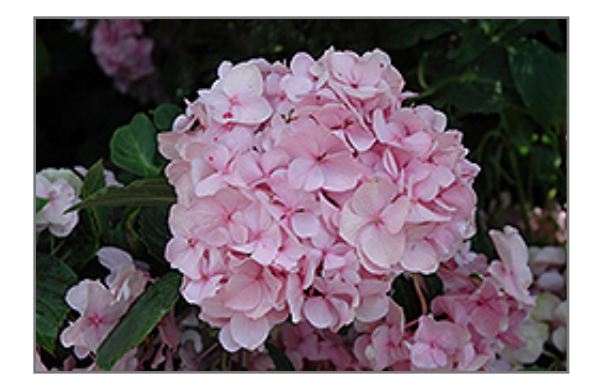
All Summer Beauty Hydrangea flowers