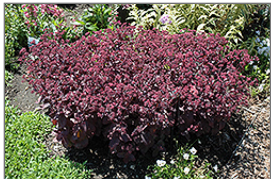
Xenox Stonecrop in bloom