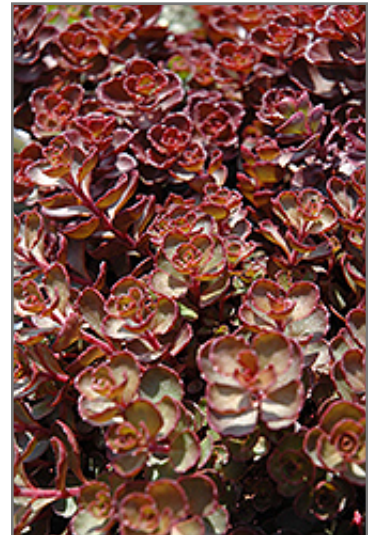
Voodoo Stonecrop foliage

Voodoo Stonecrop is recommended for the following landscape applications;