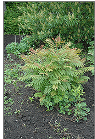
Sem False Spirea