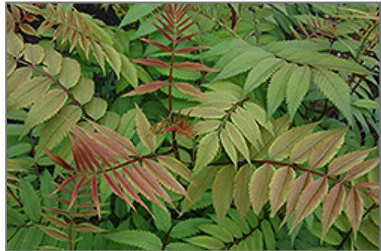
Sem False Spirea foliage

Sem False Spirea is a multi-stemmed deciduous shrub with a more or less rounded form. Its average texture blends into the landscape, but can be balanced by one or two finer or coarser trees or shrubs for an effective composition.