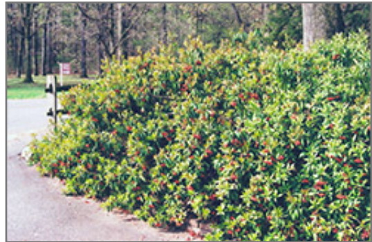
Wavy-leaved Chinese Stranvaesia fruit

Wavy-leaved Chinese Stranvaesia is a multi-stemmed evergreen shrub with a more or less rounded form. Its average texture blends into the landscape, but can be balanced by one or two finer or coarser trees or shrubs for an effective composition.