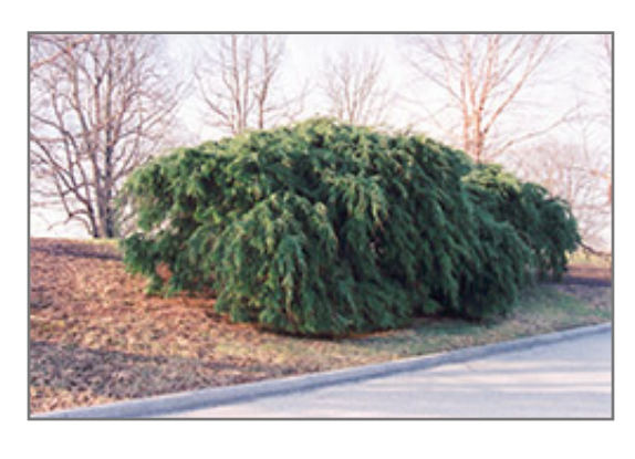
Sargent's Weeping Hemlock