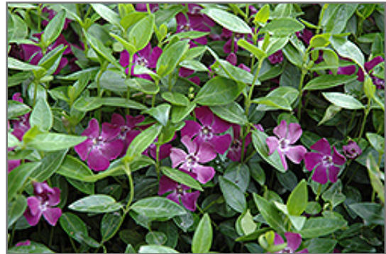
Burgundy Periwinkle flowers

This is a high maintenance plant that will require regular care and upkeep, and should not require much pruning, except when necessary, such as to remove dieback. Deer don't particularly care for this plant and will usually leave it alone in favor of tastier treats. Gardeners should be aware of the following characteristic(s) that may warrant special consideration;