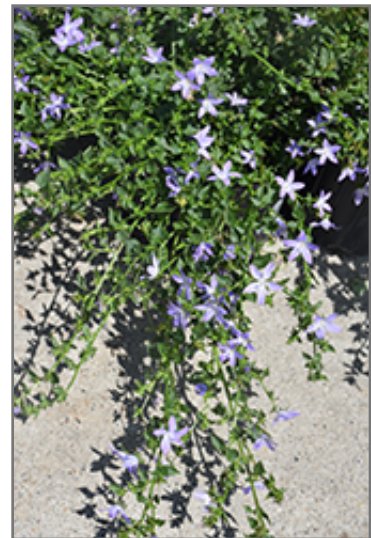
Blue Waterfall Serbian Bellflower in bloom