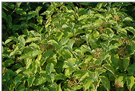
Arctic Sun Dogwood foliage