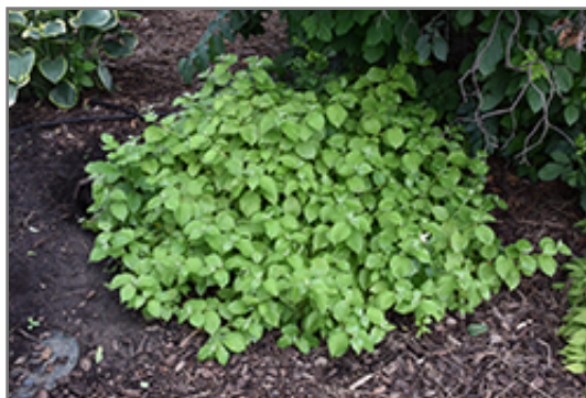
Arctic Sun Dogwood

This shrub will require occasional maintenance and upkeep, and is best pruned in late winter once the threat of extreme cold has passed. It is a good choice for attracting birds to your yard. Gardeners should be aware of the following characteristic(s) that may warrant special consideration;