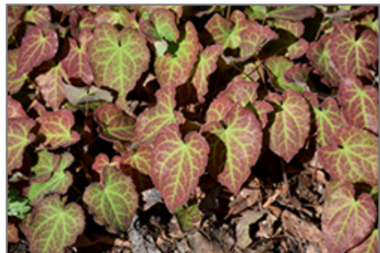
Froehnleiten Bishop's Hat foliage