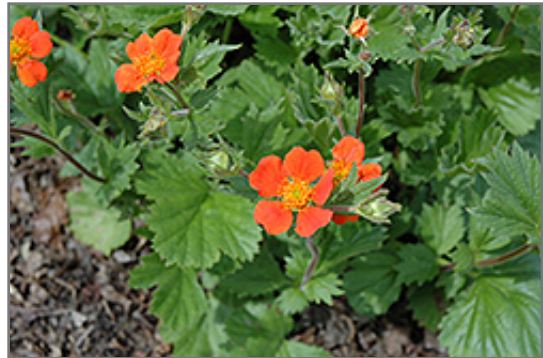
Boris Avens flowers

This is a relatively low maintenance plant, and should be cut back in late fall in preparation for winter. It is a good choice for attracting butterflies to your yard, but is not particularly attractive to deer who tend to leave it alone in favor of tastier treats. It has no significant negative characteristics.