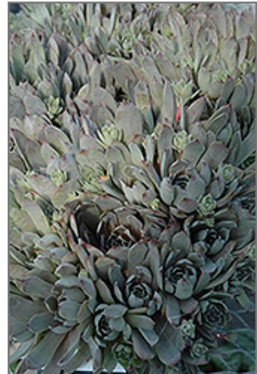
Big Blue Hens And Chicks