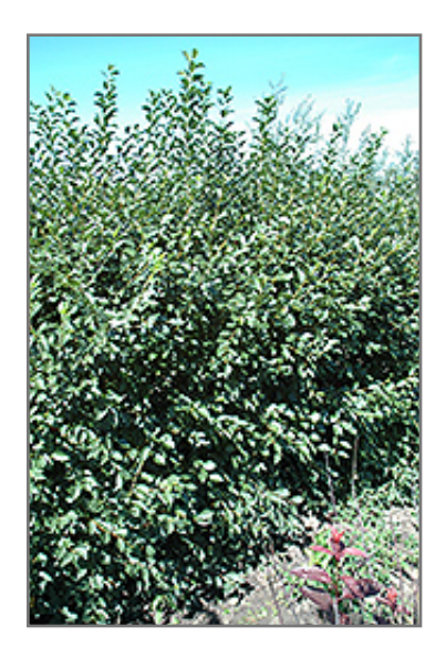
Romeo Cherry

This shrub is typically grown in a designated area of the yard because of its mature size and spread. It should only be grown in full sunlight. It does best in average to evenly moist conditions, but will not tolerate standing water. It is not particular as to soil type or pH. It is highly tolerant of urban pollution and will even thrive in inner city environments. This particular variety is an interspecific hybrid.