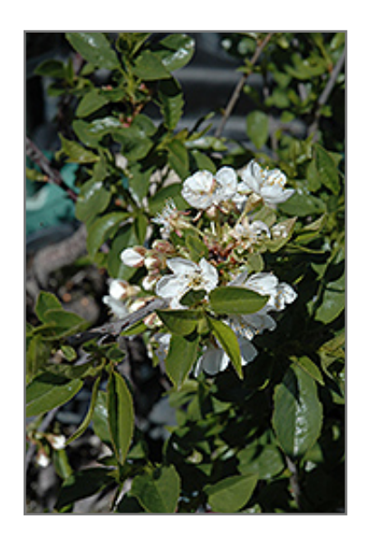
Romeo Cherry flowers