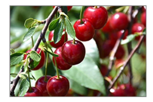
Romeo Cherry fruit

Romeo Cherry features showy clusters of fragrant white flowers along the branches in mid spring. It has green deciduous foliage. The glossy oval leaves turn yellow in fall. The fruits are showy crimson drupes carried in abundance in mid summer.