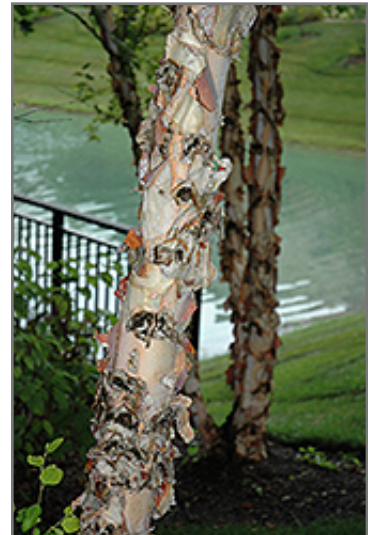
River Birch bark