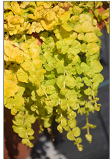
Goldilocks Creeping Jenny foliage

This plant will require occasional maintenance and upkeep, and should not require much pruning, except when necessary, such as to remove dieback. It is a good choice for attracting bees to your yard. Gardeners should be aware of the following characteristic(s) that may warrant special consideration;