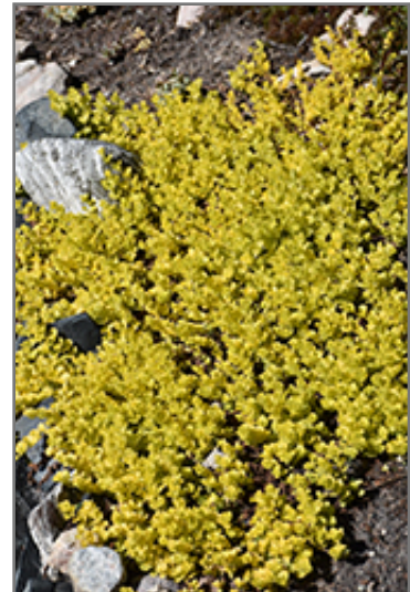
Goldilocks Creeping Jenny

Goldilocks Creeping Jenny will grow to be only 6 inches tall at maturity, with a spread of 3 feet. When grown in masses or used as a bedding plant, individual plants should be spaced approximately 24 inches apart. Its foliage tends to remain low and dense right to the ground. It grows at a fast rate, and under ideal conditions can be expected to live for approximately 10 years. As an herbaceous perennial, this plant will usually die back to the crown each winter, and will regrow from the base each spring. Be careful not to disturb the crown in late winter when it may not be readily seen!