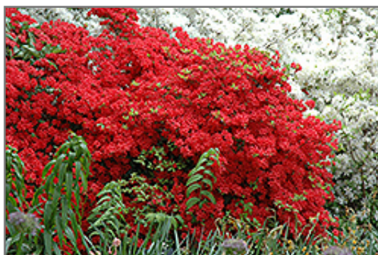
Stewartstonian Azalea in bloom

Stewartstonian Azalea is recommended for the following landscape applications;