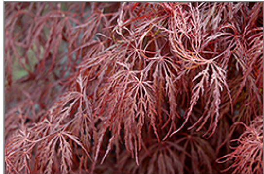
Crimson Queen Japanese Maple foliage

Crimson Queen Japanese Maple is recommended for the following landscape applications;