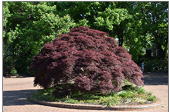
Purple-Leaf Threadleaf Japanese Maple

This is a relatively low maintenance shrub, and should only be pruned in summer after the leaves have fully developed, as it may 'bleed' sap if pruned in late winter or early spring. It has no significant negative characteristics.