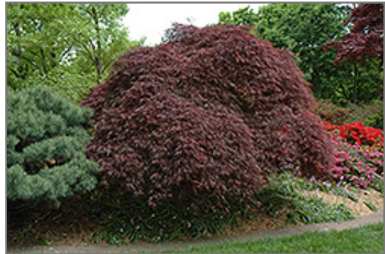
Red Select Cutleaf Japanese Maple