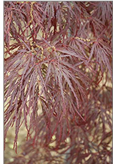
Garnet Cutleaf Japanese Maple foliage

This is a relatively low maintenance shrub, and should only be pruned in summer after the leaves have fully developed, as it may 'bleed' sap if pruned in late winter or early spring. It has no significant negative characteristics.