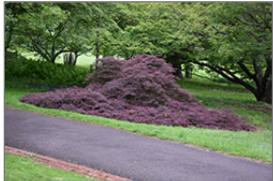
Garnet Cutleaf Japanese Maple