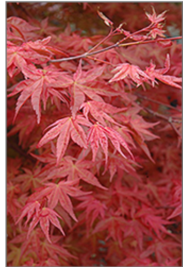
Suminagashi Japanese Maple foliage

This tree does best in full sun to partial shade. You may want to keep it away from hot, dry locations that receive direct afternoon sun or which get reflected sunlight, such as against the south side of a white wall. It prefers to grow in average to moist conditions, and shouldn't be allowed to dry out. It is not particular as to soil pH, but grows best in rich soils. It is somewhat tolerant of urban pollution, and will benefit from being planted in a relatively sheltered location. Consider applying a thick mulch around the root zone in winter to protect it in exposed locations or colder microclimates. This is a selected variety of a species not originally from North America.