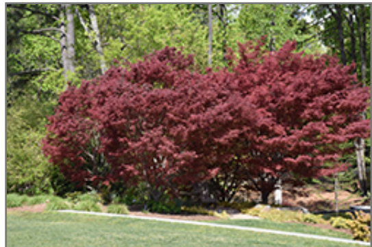
Suminagashi Japanese Maple