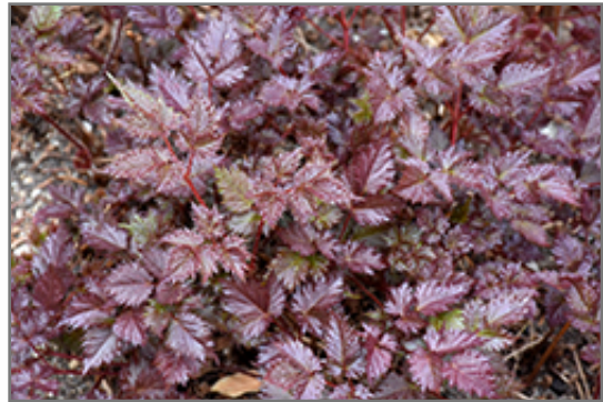
Delft Lace Astilbe foliage